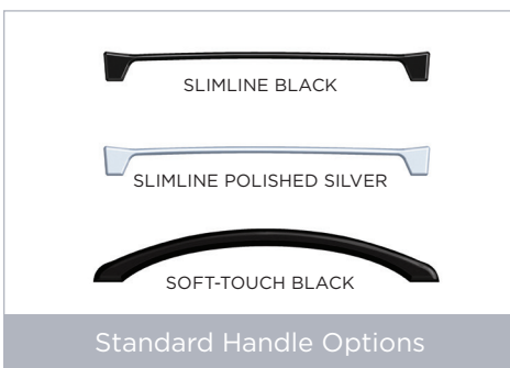
Standard Handle Options