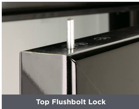
Top Flushbolt Lock