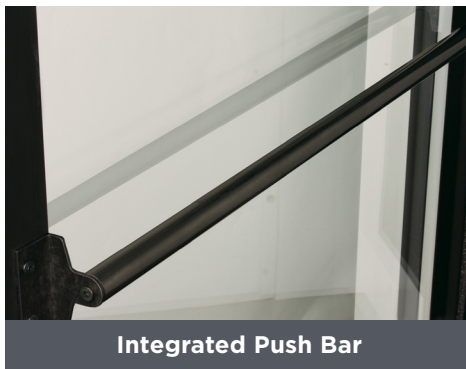
Integrated Push Bar