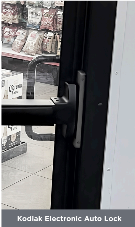
Kodiak Electronic Auto Lock