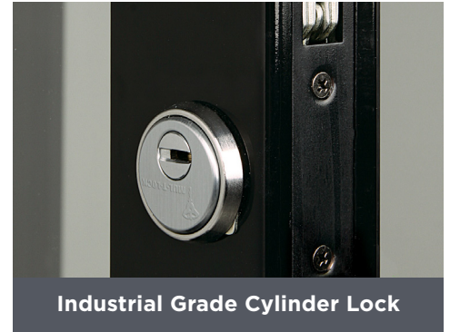
Industrial Grade Cylinder Lock