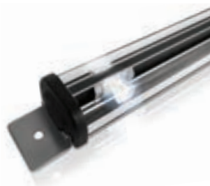
Optimax Pro 24 LED